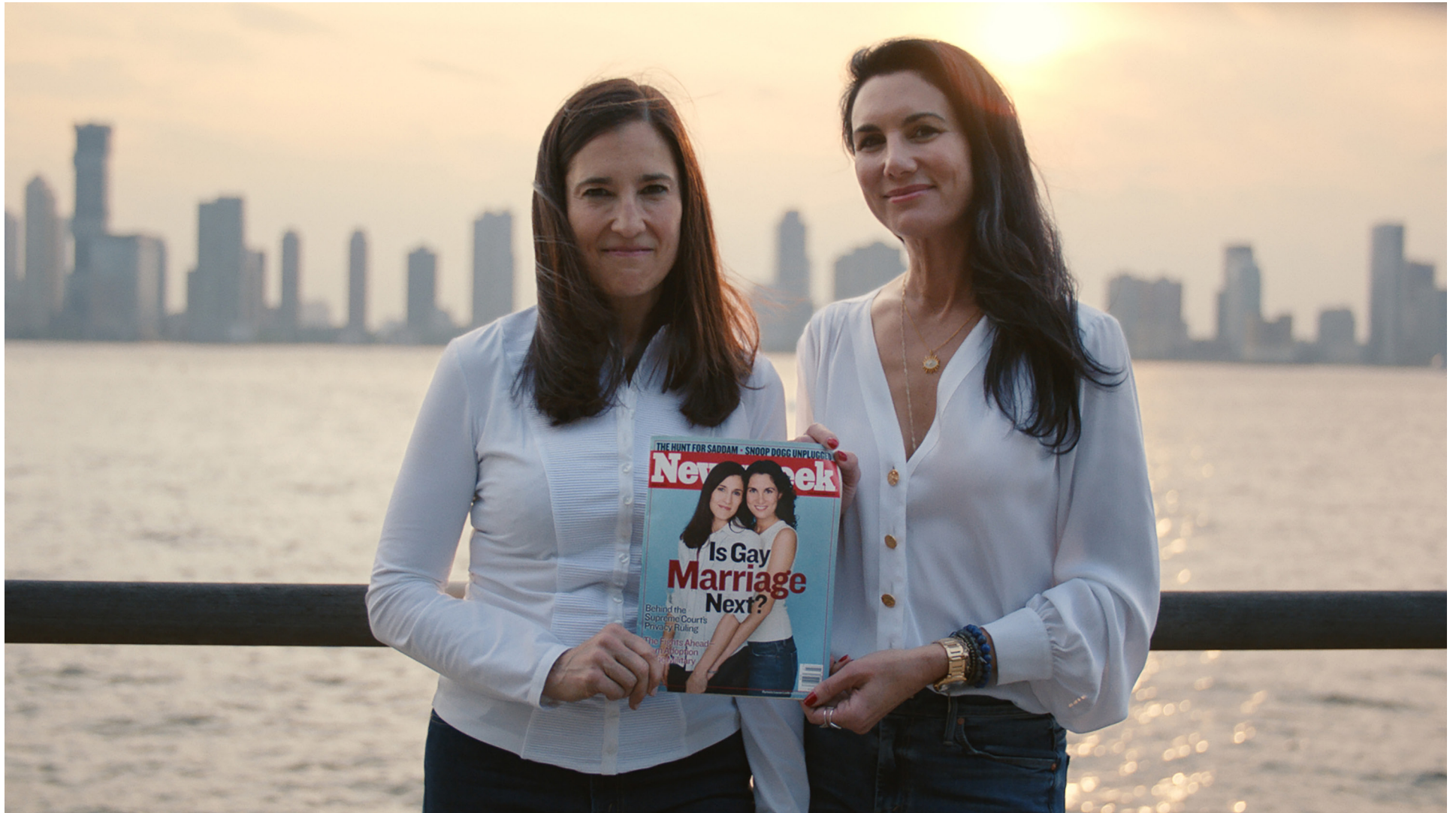
Production still 1